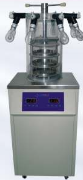
LFD 300 B