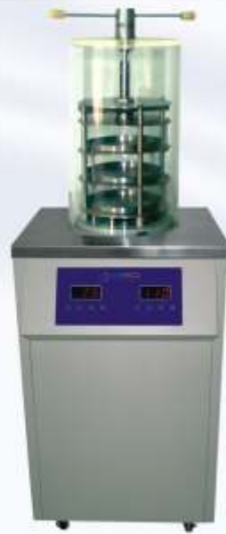
LFD 300 A