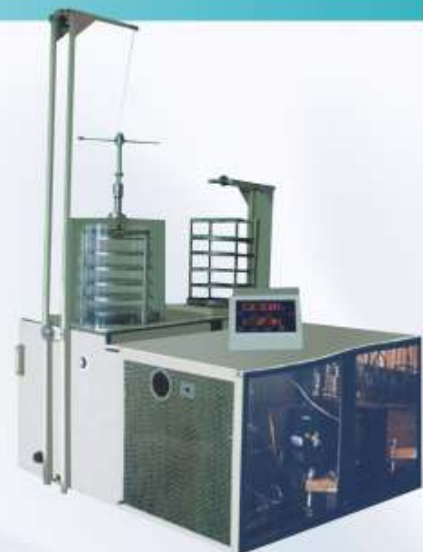
LFD 400 B